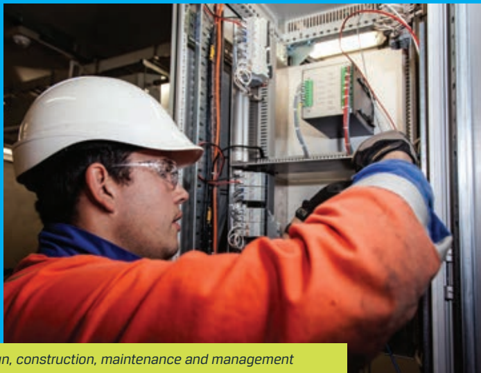
Design, construction, maintenance and management

The development of our employees allows us to provide career progression opportunities and promotion from within the organisation. This results in a skilled, high performing, cohesive and loyal team culture, providing a stable workforce and industrial relations environment.